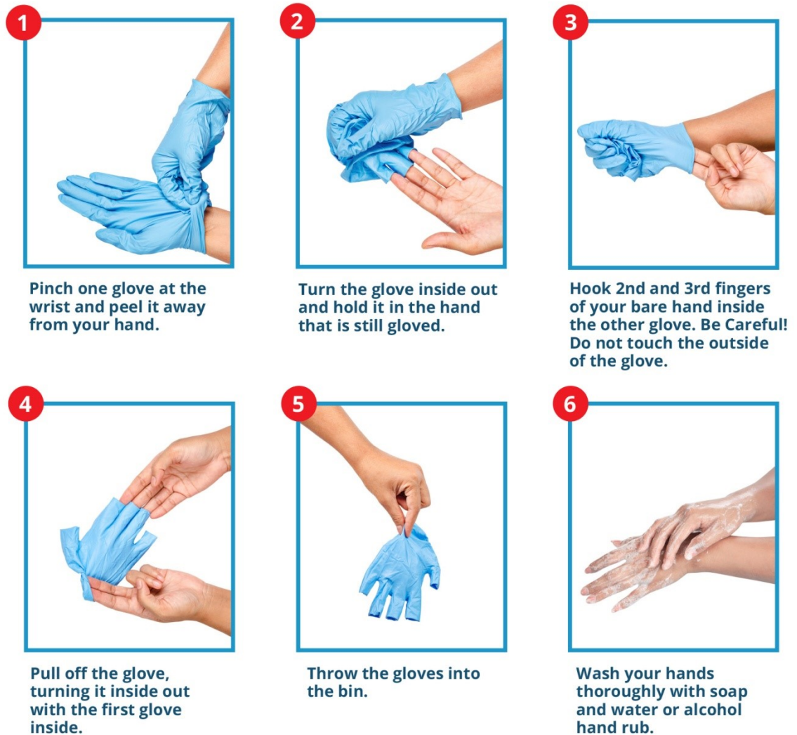
Fig.2 proper removal of gloves

For more information on proper use of gloves, visit covid19health.gov.mt